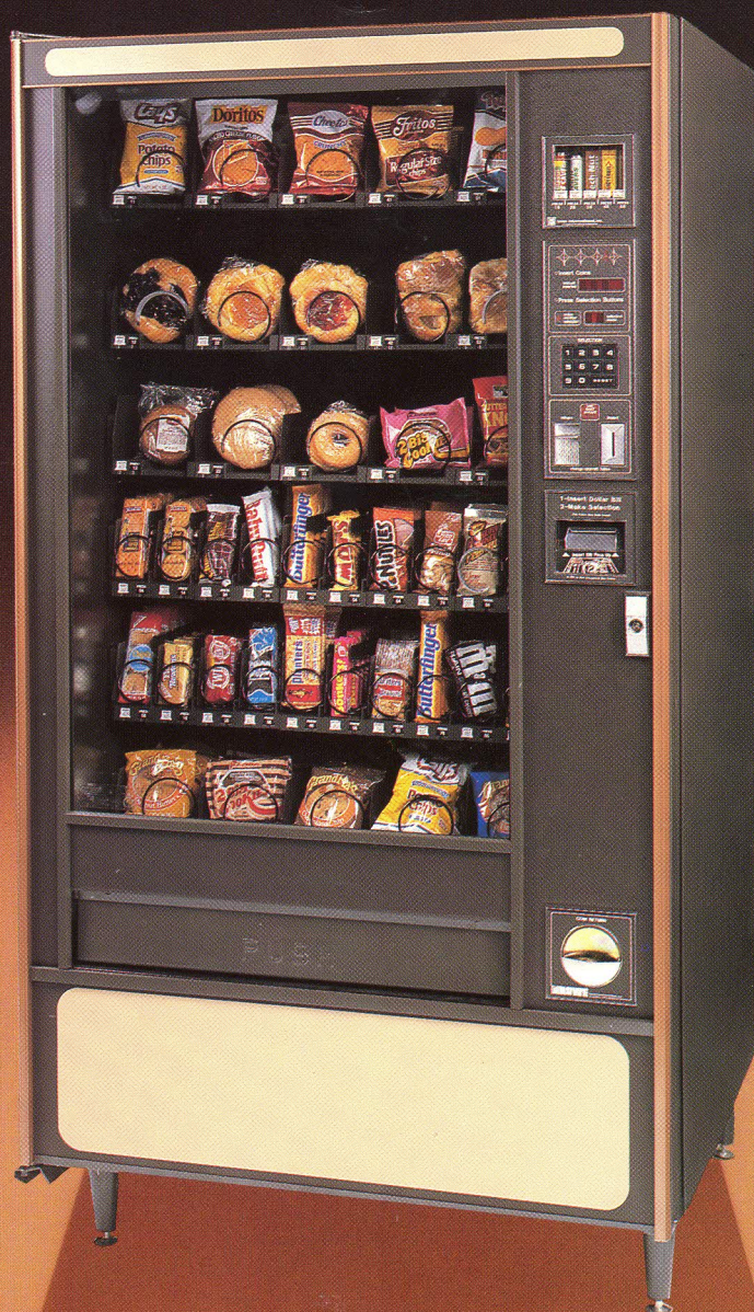
4900S SNACK/CANDY VENDOR IN STELLAR STYLING